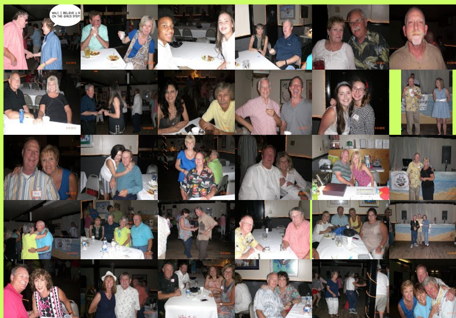
Clue 2 of 2: this is the max # of clues you will get.