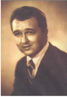
Reprint from the Shagger's Hall Of Fame